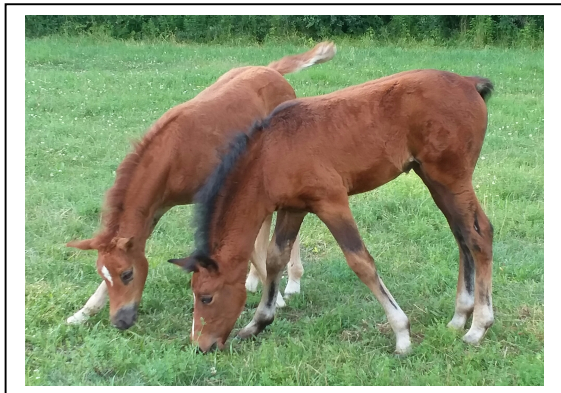
Old Vermont Prudence and Old Vermont Genesee