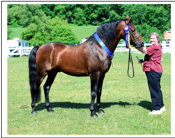
Baroncrest Levi Ash

A.I. and “took” on one attempt, so I was excited about that. Her foal is due sometime around Memorial Day. Sadly my older Lippitt mare was not as cooperative, but we’ll try again this Spring. Her 2019 filly Prudence is now in Wisconsin and I’d sure love another like her. Genesee, her pasture buddy, has sprouted up at age 2 and is taller than her dam. I’m hoping Baroncrest Levi Ash, my 14-year-old Lippitt stallion, can start training soon so we can work in a few competitions. Levi was Champion Stallion at Heritage Day in 2018 and 2019, and Reserve Champion Stallion (behind his son, Old Vermont Recruit!) at the Lippitt show in 2019. In the meantime, my immediate focus is on necessary repairs inside and outside the barn.